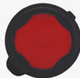
Blank Included x 4