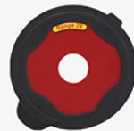
Range 29 Optional