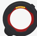
Range 74 Included