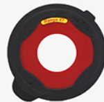
Range 47 Optional