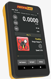
Gauge Sold Separately